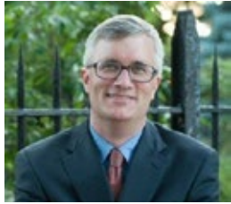
BRIAN KAVANAGH SENATOR