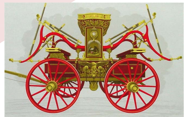
"United States Fire Company"