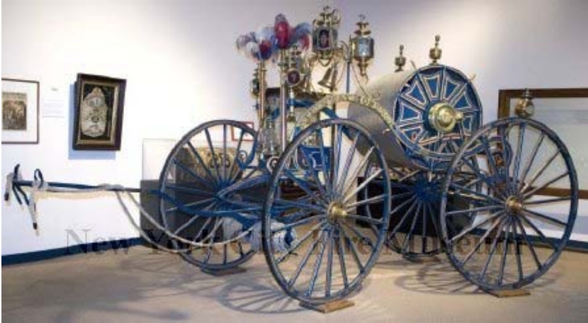
Steinway Hose Co. 7 hand pulled hose reel, Object ID 10.197