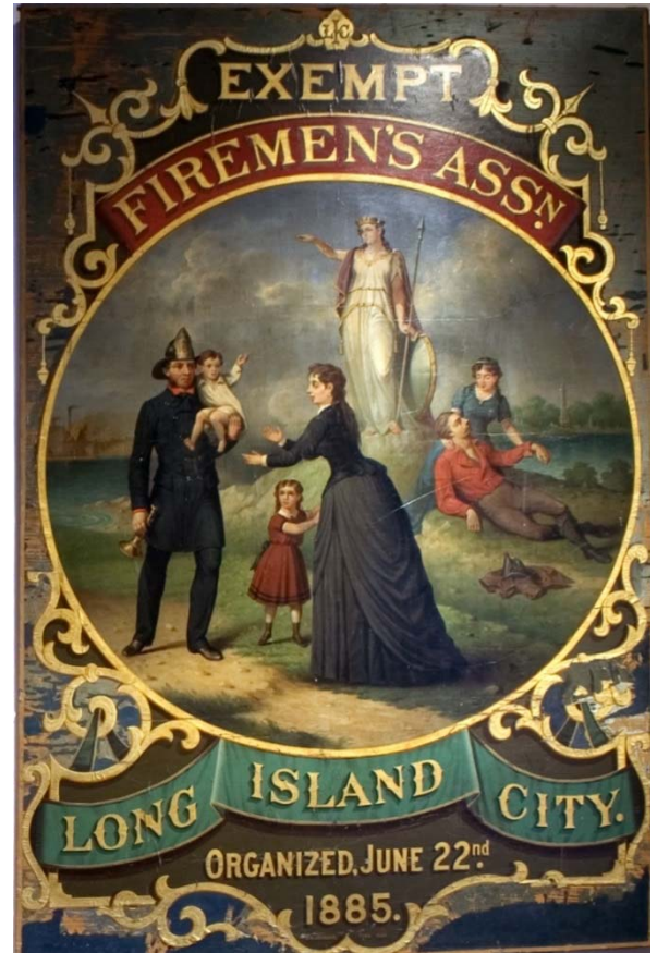
Exempt Firemen's Association of Long Island City, Object ID 2012.0834